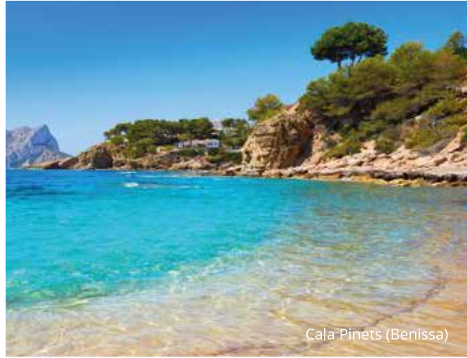
Cala Pinets (Benissa)