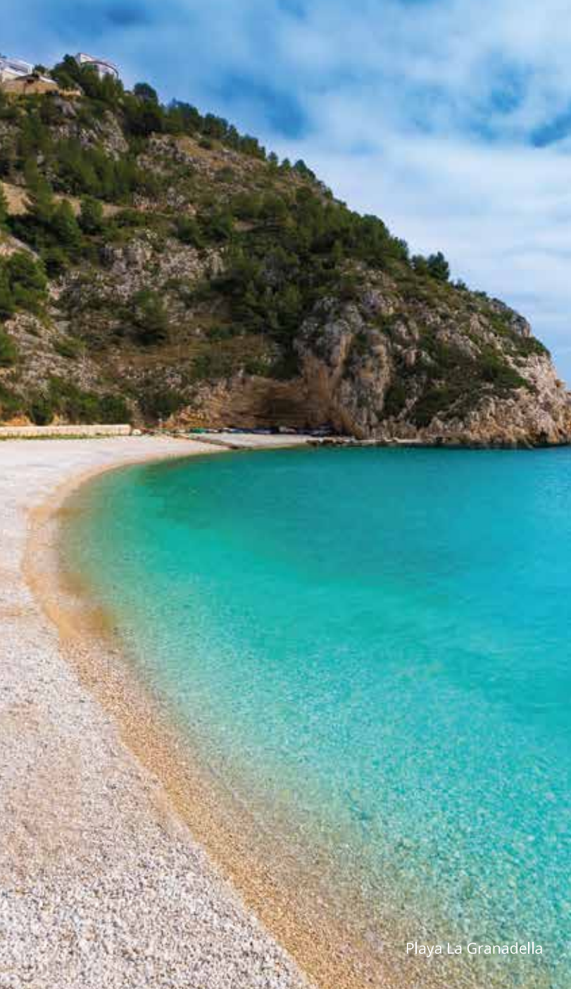
Playa La Granadella